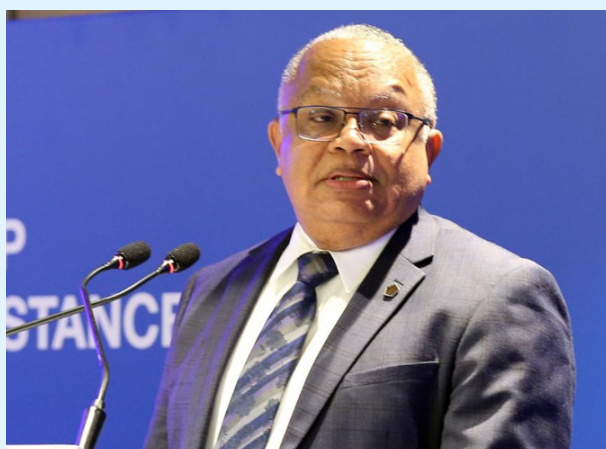
Dr Jerome Walcott Minister of Foreign Affairs and Foreign Trade of Barbados

Speaking on behalf of GLG Co-Chair and Prime Minister of Barbados H.E. Ms Mia Amor Mottley, who was unable to attend due to illness, the Minister of Foreign Affairs of Barbados, Dr Jerome Walcott, noted that “while AMR is not a compelling acronym, antimicrobial resistance is an issue that should compel us all.” At stake are “our most precious medicines, global food production, plants and the environment, and human livelihoods and economies”, he said, referring to AMR as “a looming crisis, a silent pandemic” and calling for political leadership and action on AMR in every country. “We need political action”, he said. “AMR is not a technical matter. It is political... We also need to engage the private sector. We need to engage young people in the same way that they are engaged in the climate crisis, because it is their future at stake. And we need a response that is adequately financed,” Minister Walcott said. “Please act. Please engage in this issue, and in so doing, help to create a healthier, safer, more equitable and prosperous world.”