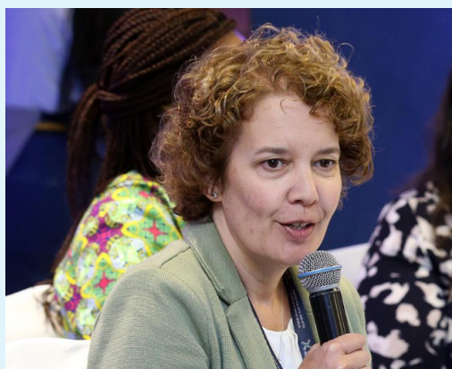
Ms Jo Lomas UK Commonwealth Envoy

Ms Jo Lomas, UK Commonwealth Envoy, was asked how the Commonwealth community can use the tools of data and partnerships in the fight against AMR. She noted that as with many public health and other policy challenges, much better-quality data are needed to inform effective policymaking. Accordingly, the United Kingdom (UK) is investing some of its Fleming Fund, a UK aid program, to support the GRAM project. GRAM is looking at the global burden of bacterial AMR and helping to build the evidence base for action. The data show that AMR is a burden for all countries across the Commonwealth, but is disproportionately affecting some regions, such as sub-Saharan Africa. She reiterated that partnership with the private sector is critical. A strong example of this is the £100 million UK collaboration with Unilever on handwashing, which has reached over 1.2 billion people in 37 countries, including 18 from the Commonwealth.