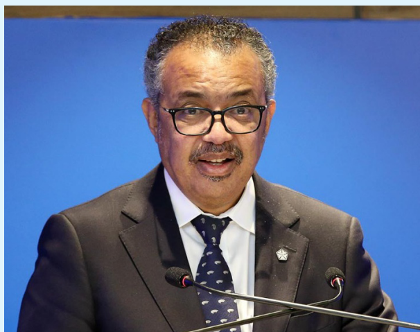
Dr Tedros Adhanom Ghebreyesus Director-General of the World Health Organization