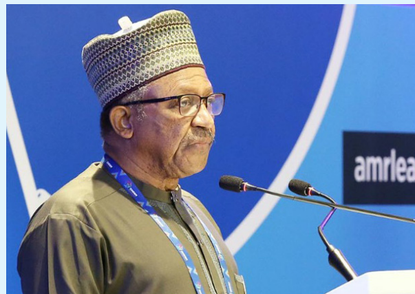
Dr Osagie Ehanire Minister of Health of Nigeria

reckless use of antibiotics. With regard to creating awareness, he emphasized the importance of strengthening health promotion, improving socio-behavioural change and better communicating with users of antimicrobials given that a large number of professionals are not aware of the risks and hazards of the abuse of antibiotics.