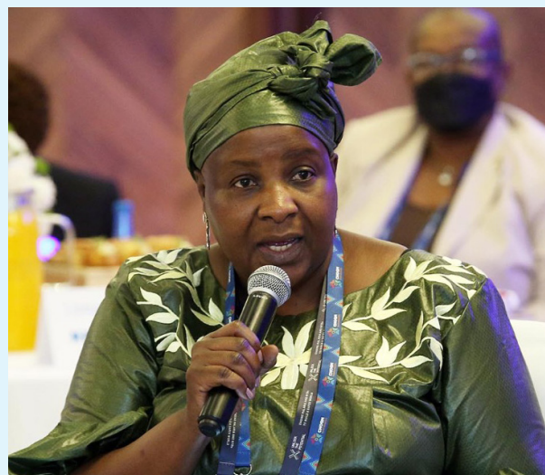
Ms Khumbize Kandodo Chiponda Minister of Health of Malawi

Asked how countries can respond to the challenge of AMR, Ms Khumbize Kandodo Chiponda, Minister of Health of Malawi, highlighted the ongoing need for investment in countries. “We might have good plans on paper”, she said, “but we need funding, and we need sustainability because it is only sustainability that will make a difference in the fight against AMR”. She noted that Malawi is one of the few countries in the African region with a small, dedicated, national budget for AMR. “I’m happy that here we have our WHO DG here, we have other members from other organizations here”, she said. “We need your support in our countries for us to advance the fight against AMR.”