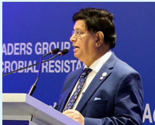
Dr A.K. Abdul Momen Foreign Minister of Bangladesh

Dr A.K. Abdul Momen, Foreign Minister of Bangladesh, spoke on behalf of GLG Co-Chair and Prime Minister of Bangladesh H.E. Ms Sheikh Hasina, expressing her gratitude for the leadership of her fellow GLG members. He noted that the misuse of antibiotics and other antimicrobials in humans, animals and plants was accelerating the development and prevalence of AMR and increasing the risk of future pandemics. Calling for action on AMR that is integrated across the Sustainable Development Goals, he emphasized the cascading effects of AMR on human and animal health, food systems, livelihoods, the economy and increased risks of poverty and inequality. Concrete actions that governments must take include regulating the prescription, sale and marketing of antimicrobials, surveillance and ensuring access to innovation. Minister Momen also emphasized the importance of breaking institutional silos and working transversally across governments, international organizations, civil society and the private sector in a whole-of-society approach. “Since AMR has emerged as another substantial threat to humanity”, he said, “we need committed, coherent actions for an accelerated response to secure our common future from drug resistant diseases.”