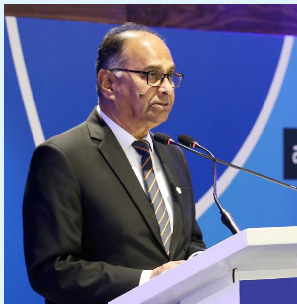
Mr Alan Ganoo Minister of Foreign Affairs, Regional Integration and International Trade of Mauritius

Mr Alan Ganoo, Foreign Minister of Mauritius, noted that AMR is a growing threat to global public health that transcends national boundaries and socioeconomic divisions. “We are fully alive to the fact that AMR is a multifaceted problem of crisis proportions with significant health, economic and human implications”, he said, noting that in 2019-2020 Mauritius reported having among the highest prevalence of multi-drug-resistant organisms in its ICUs in the world. “We fully support the GLG in its efforts to scale up international action and coordination in promoting appropriate antibiotic use”, said Minister Ganoo, “and we will work further together in promoting a One Health approach.”